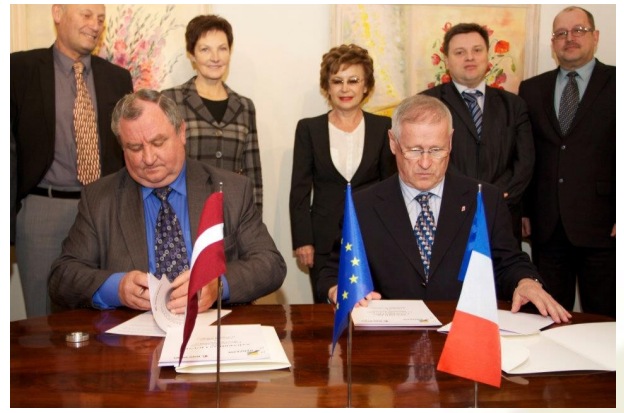
Signing of the cooperation agreement with Lower Rhine

General Council of Lower Rhine because the cooperation agreement between the partners was re-signed for 4 more years. The official ceremony was held in Valmiera; it was attended by the Ambassador of France in Latvia, the Chairman and members of VPR Development Council, and members of the Lower Rhine Council. Since the beginning of the cooperation, a number of culture and tourism projects have been initiated and implemented. In 2013 we would like to widen the scope of our activities and to start cooperation in the business sector.