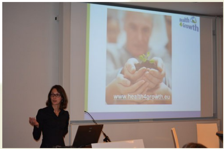
Lunch event of Health4Growth in Eindhoven

In 2012 the Medi@TIC project was looking for creative and successful solutions for ICT development in Vidzeme. Together with representatives from the Vidzeme University of Applied Sciences, the Vidzeme Television and the company "Epata Studio" we visited the project partners in Spain, Norway and Italy. Vidzeme surprised representatives from 11 European countries with our professionals in the audiovisual sphere. Read More.