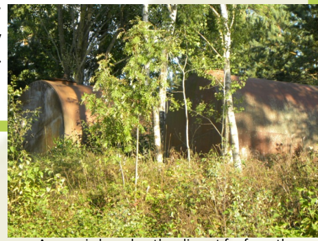
Ammonia barrels—they lie not far from the place where the seminar was held on 30.08. There is a serious pollution risk.

summer of 2012, a GIS data layer about potentially polluted and polluted places was created in the territory of the Vidzeme Planning Region; it is a practical tool for territory planning. For more information click here.