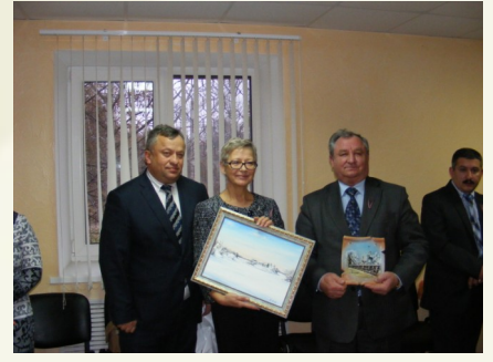
Vidzeme Days in St. Petersburg

In November the Vidzeme Days were held in St. Petersburg. This event was a great opportunity for the Vidzeme Region to tell their Russian colleagues about their offers and opportunities for tourists and to discuss cooperation prospects in the future. During the event, 23 entrepreneurs from Latvia met entrepreneurs from St. Petersburg and they discussed potential of cooperation.