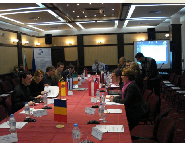
RitsNet partners at the conference about ITS