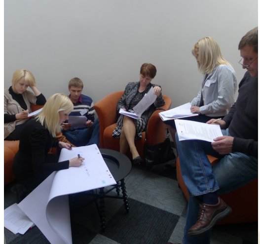
Via Hanseatica partners in action during the workshop about Via Hanseatica travel guide

One of the Via Hanseatica activities is to make small improvements to 12 tourism objects. In 2012 works in 5 objects in the Vidzeme region have been finished and now visitors can enjoy better services there. For more information about the project activities click <a href="https://example.com/here/beta/46/">here</a>.