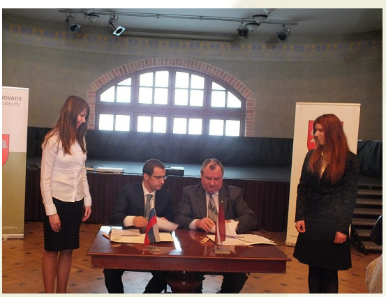
Signing of the agreement with Pskov