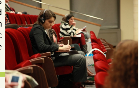
MOG partners in Poland

a state of play report. During the state of play report analysis of documents for public transport strategies were carried out. The obtained results will be included in the long-term development strategy of the region that will provide specific recommendations to the public transport system in the following years. More information.