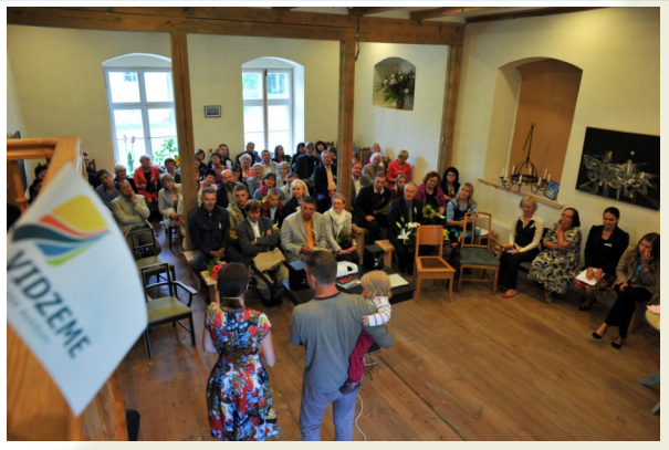
Garden Festival in Vidzeme

The Vidzeme Planning Region took an active part in all project activities. Thanks to the project "Trans in Form", the region got a new logo and a slogan "The only way is up!"; there was also a campaign to find the most enterprising people in Vidzeme, the most interesting tourism object and the most creative entrepreneurs. A home page about success stories in Vidzeme was created during the project (www.vidzemesstasti.lv). More about project.