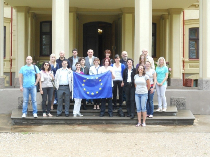
Histcape partners in Dikļi

On June 25 the Vidzeme Planning Region organized together with partners from 11 different countries an open conference "Historical Assets and Related Landscapes" that was held in Dikļi — one of the most beautiful venues in Vidzeme - experts and government representatives expressed their views and judgments on the sustainable management of cultural heritage in Vidzeme and the value of its landscape. More about the project read <a href="here">here</a>.