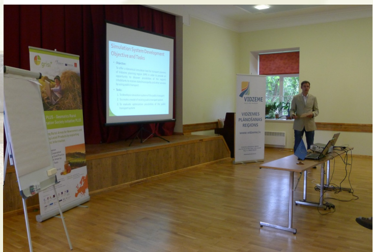
Grisi Plus Conference on usage of geomatics tools held in Amata