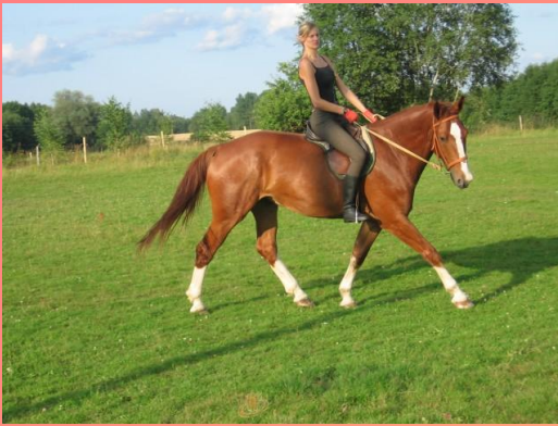
Horses and everything around them