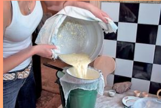
Preparing home cheese