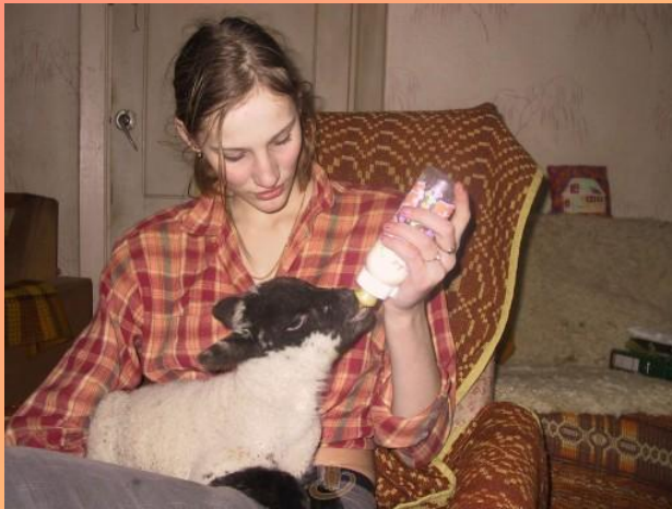
Animal baby sitter